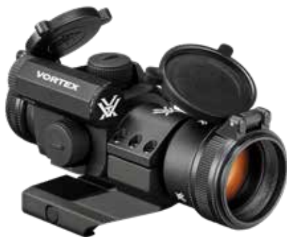
Cantilever Ring Option (Lower 1/3 Co-Witness Height)

The StrikeFire® II includes a cantilever mount. The cantilever ring mount puts the optic bore center 40 mm above the base, providing lower 1/3 co-witness with iron sights on flat top AR-15 rifles.